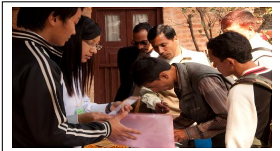
Figure 1: A glimpse of the registration session