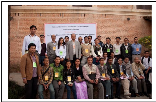
Figure 18: Group picture of the participants – Day 1

The end of the session marked the conclusion of Day 1.