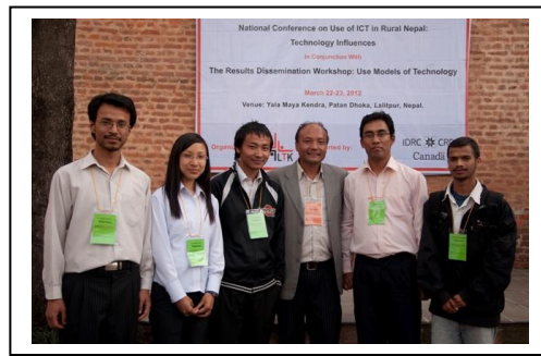
Figure 19: Group picture with student volunteers, Kathmandu University