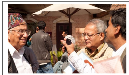
Figure 2: Participants at the registration session