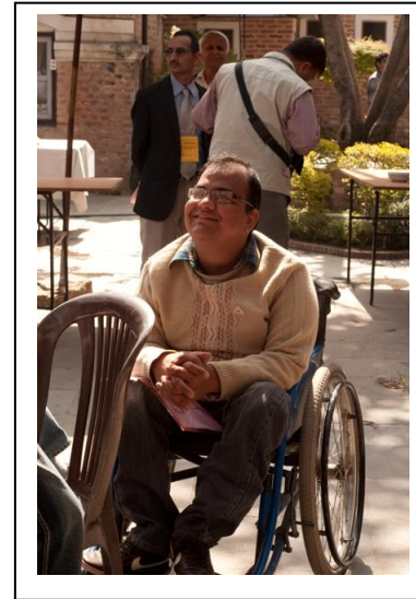
Figure 4: A participant from the conference